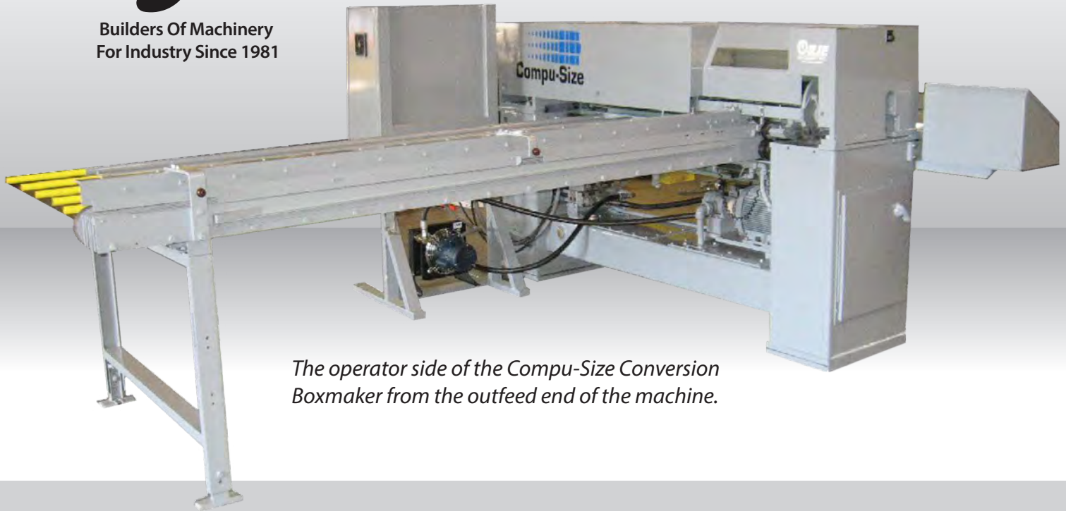
The operator side of the Compu-Size Conversion Boxmaker from the outfeed end of the machine.

Builders Of Machinery For Industry Since 1981