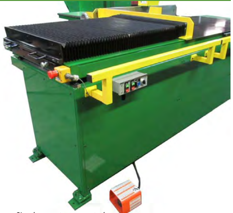
Simple, easy-to-use controls.