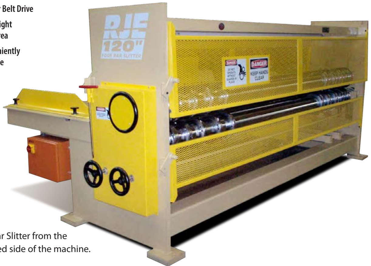
The RJE 120" Four Bar Slitter from the operator end, outfeed side of the machine.